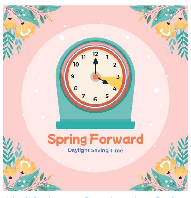
HOPE YOU SET CLOCKS FOR-WARD ONE HOUR